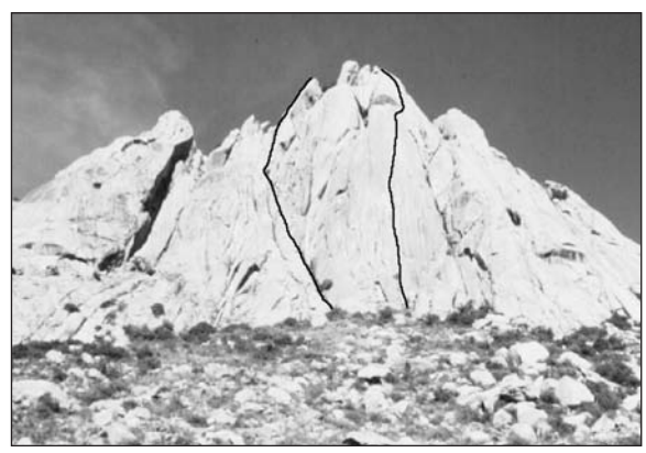
Cerro Blanco. Luis Carlos Garcia Ayala

El Cerro Blanco, Irritilas (Nómadas) and Lluvia de Estrellas. This is a brief account about the lovely land and people of the states of Durango and Coahuila, México. Desert lands with multicolored sunrises and sunsets and incomparable beauty. The Peñón Blanco massif, better known as the Cerro Blanco, is one of the most accessible walls in México. It is a granite massif with 400 meters of vertical rise. Located in a desert zone where the temperatures in winter reach 28°C (85°F), it is best visited between the months of October and March. To reach Cerro Blanco you must take the national highway, Durango-Cuencame No. 40, to the town of Yerbanís where you turn toward Peñón Blanco until reaching Pueblo de Nuevo Covadonga and encounter the gap from the west of the rock massif. The Base Camp is two kilometers from the base of the wall. It is important to arrive with all of the food, fuel, and water you will need. This is a destination for adventure climbing. It is a one-hour approach to the base of the wall. All of the routes have been established and equipped in Yosemite style: Ground-up free climbing, placing bolts where there are no cracks for protection. There is trad, sport, and bouldering. There is vast potential here.