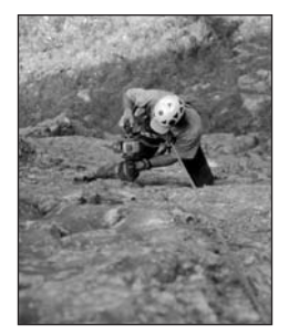
Drilling down on Logical Progression. Luke Laeser

Would someone erase the dream, hard work, and fruition of Lucas et al's efforts? And deny climbers interested in repeating this route? Anyone can put up the remaining lines in trad style; then they won't become sport routes. Future generations will still have a vast reserve of unexplored rock. No need to ban bolts yet. If rap-bolters